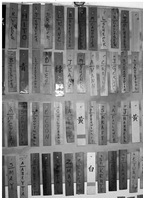
A RANK BOARD SHOWS STUDENT PROGRESSION.