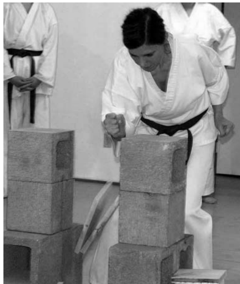
YOU CAN DO MORE THAN YOU THINK YOU CAN. TAMASHIWARA (BOARD-BREAKING) IS A GOOD WAY TO TEST FOCUS AND POWER. WITH A LITTLE TRAINING, ANYONE CAN DO IT.