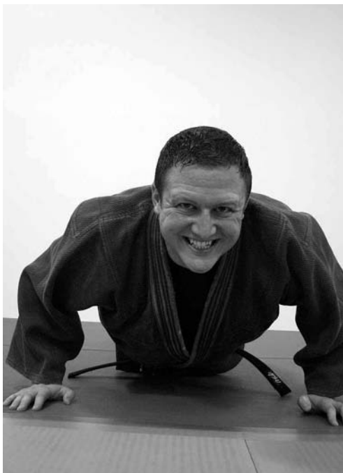
TRAINING SHOULD BE FUN AS WELL AND CHALLENGING. FITNESS IS INTEGRAL TO MARTIAL ARTS TRAINING.